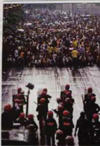
Political affray in Malaysia

thority is still at the seedling stage. Yet lately there have been nightly televised exposés of the gulf between official reassurances and the worrying reality. Even the belated stress tests raise eyebrows: they will be undertaken by the utilities themselves and checked by two regulatory agencies that previously failed to supervise the utilities properly. On July 13th Mr Kan said he wants Japan to reduce nuclear power on safety grounds, if not to get rid of it altogether. A few months ago such a policy was unthinkable, because of the risk of power shortages. The public increasingly supports it—but not Mr Kan. ■